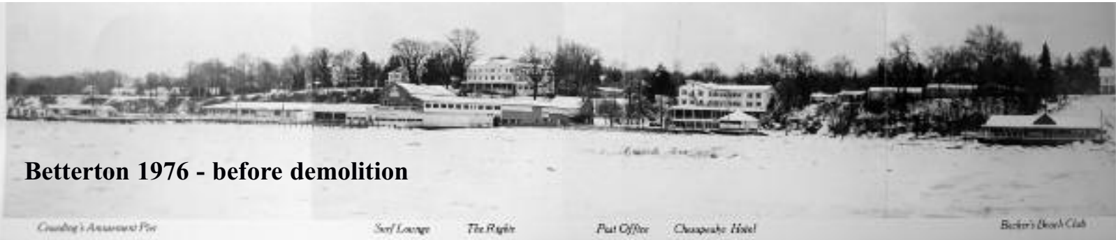
Betterton 1976 - before demolition