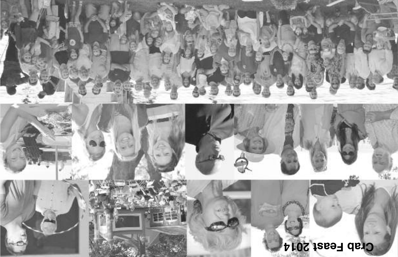
Crab Feast 2014