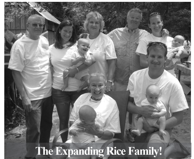
The Expanding Rice Family!